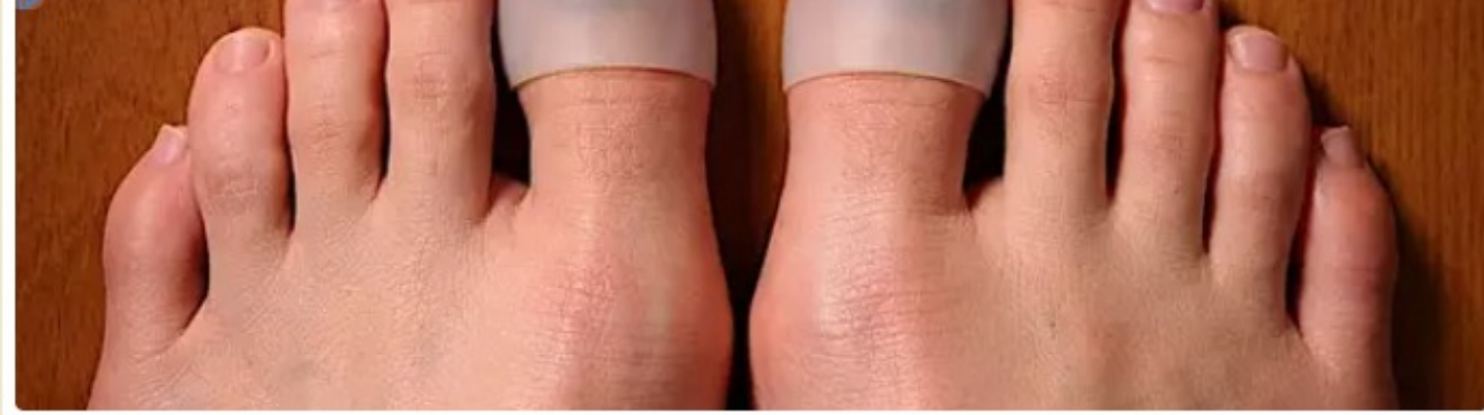
Ein uraltes japanisches Geheimnis gegen Nagelpilz – selbst im Alter