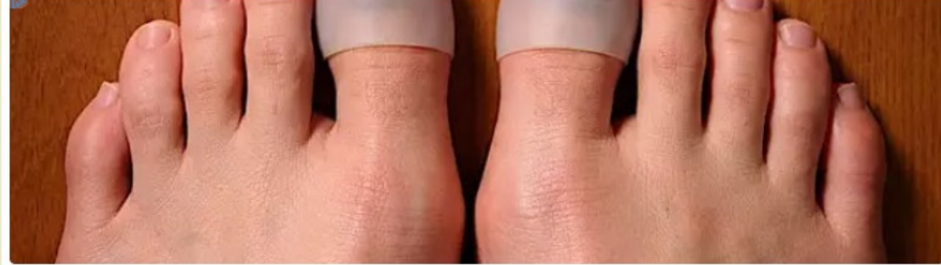
Ein uraltes japanisches Geheimnis gegen Nagelpilz – selbst im Alter