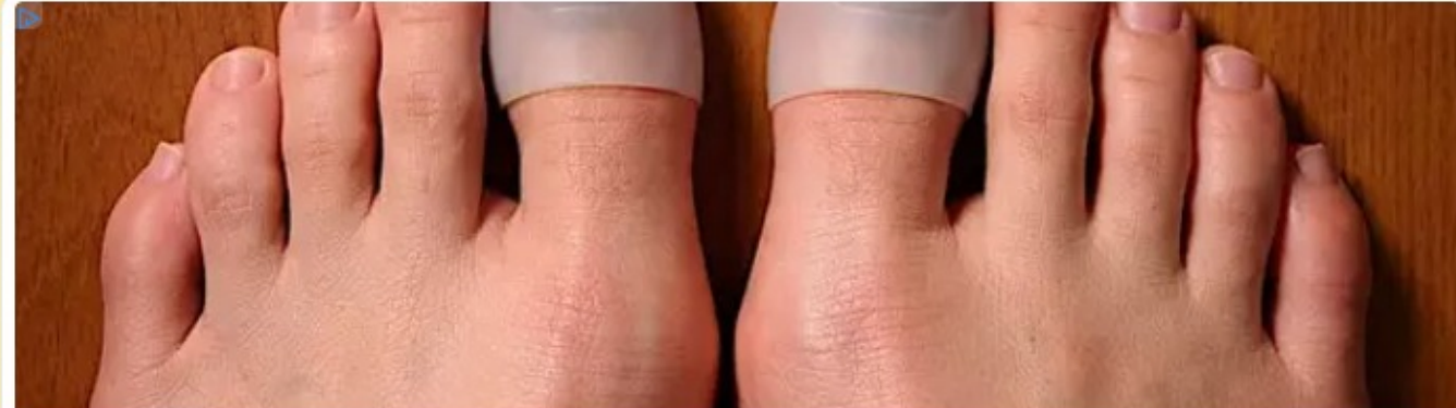
Ein uraltes japanisches Geheimnis gegen Nagelpilz – selbst im Alter