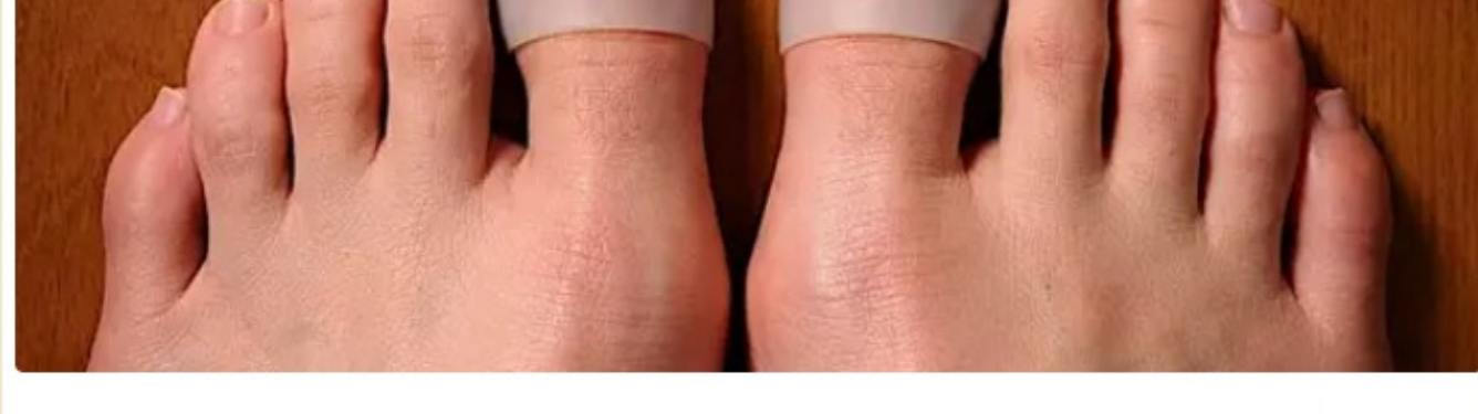
Ein uraltes japanisches Geheimnis gegen Nagelpilz – selbst im Alter