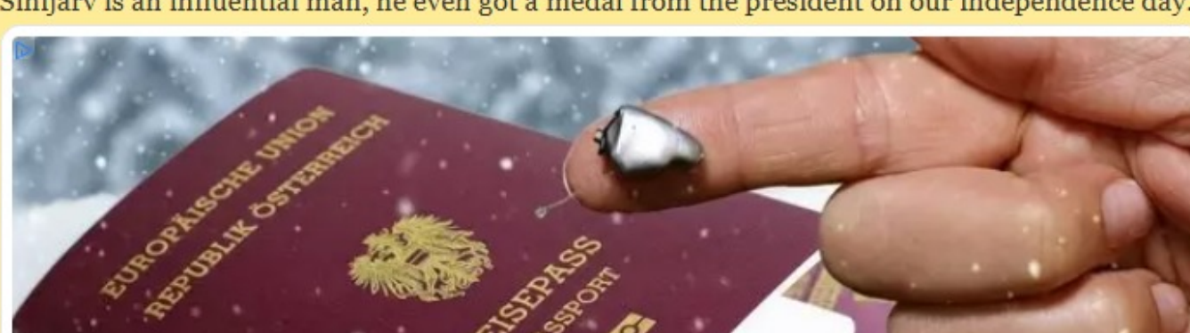
Graz: Mit diesem Trick bekommt man Hörgeräte Kostenlos