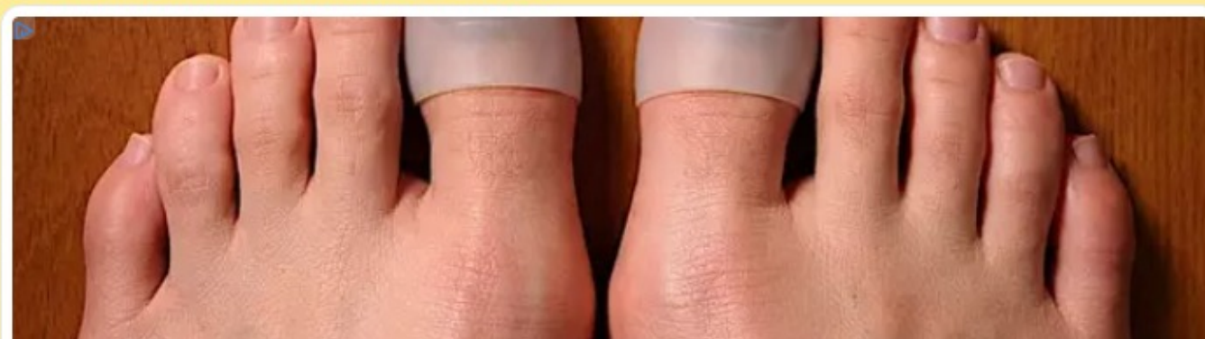
Ein uraltes japanisches Geheimnis gegen Nagelpilz – selbst im Alter